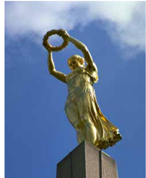
Gëlle Fra, symbol of the freedom and resistance of the Luxembourg people

After the country was liberated by the Allied troops in 1944, the Marshall Plan allowed for a major modernisation and infrastructure initiative.