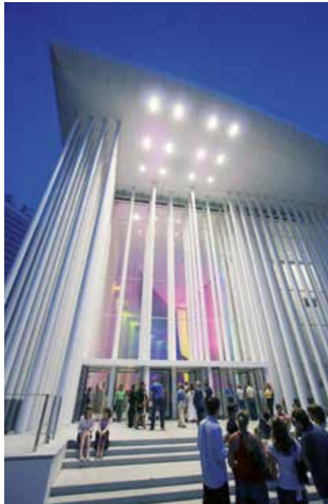
Philharmonie