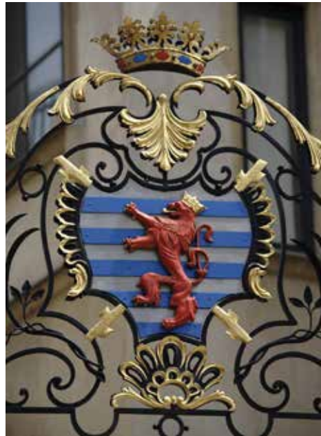
Coat of arms on the grand-ducal palace

The coat of arms has enjoyed legal protection under the law on national emblems of 23 June 1972, amended and supplemented by the law of 27 July 1993.